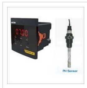
Online PH Meter