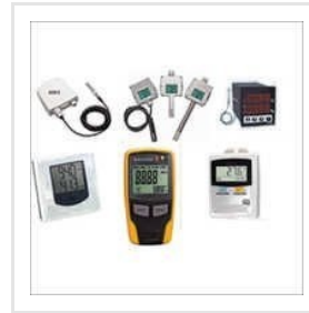
Humidity Transmitter Controller