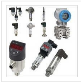
Temperature Pressure Transmitter