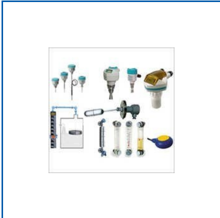
ELECTRIC LIQUID LEVEL INSTRUMENTS