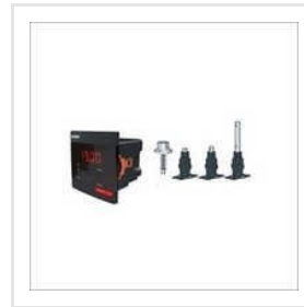
TDS Indicator Controller