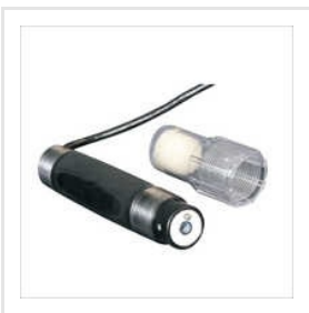
Brodley James PH Sensor