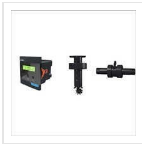
Digital Flow Meter