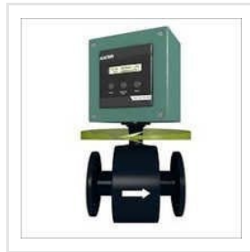
Electro Magnetic Flow Meter