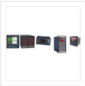
Temperature Scanner Datalogging System